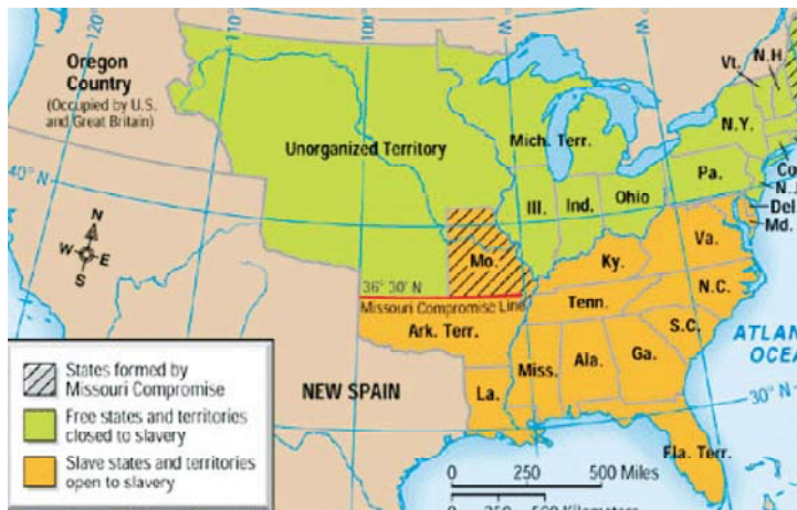
1820 Missouri Compromise